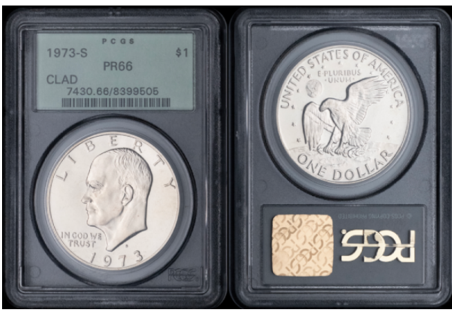
Lot 3: 1973-S Eisenhower Dollar (Clad), PCGS Old Generation Holder (OGH) PR-66