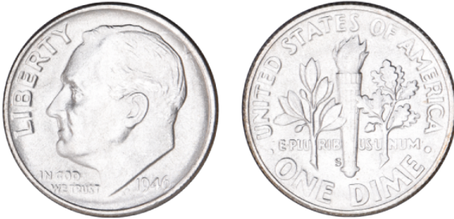
Lot 2: 1946-S Roosevelt Dime, Gem Brilliant Uncirculated